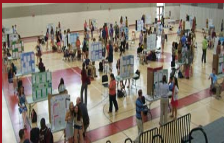
Senior Internship Exhibition

The Senior Internship Program is available to qualified seniors during fourth quarter of the senior year. Usually, over 90% of the senior class will participate. Students are encouraged to find an internship in a field of their choice, while others choose to design an independent research project. Recent internship placements include the Massachusetts State House, the Boston Common Magazine, Lahey Clinic, Genzyme Biotech Company, Massachusetts Audubon Society and the North Shore Navigators. English and elective credits are earned to satisfy the graduation requirements. Students write a paper based on their experiences and share their experience through an oral presentation.